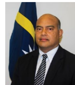
H.E. Hon. David W.R. Adeang, M.P President Republic of Nauru